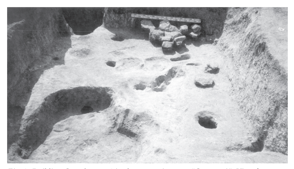
Fig. 2. Building Complex no. 6 in the excavation area "Osnovnoj". View from north.

The first of them, Building Complex no. 6, consists of the remains of a relatively large house of dug-out type of quadrangular plan, oriented N-S along its long axis, measuring 4.5-4.75 x 4.0 m, 1.1-1.2 m deep and with an area of about 19 m² (Fig. 1-2). The bedrock walls of this dug-out were even and upright, without any visible traces of destruction, suggesting that the pit was filled fairly quickly after its construction and all apparently on a single occasion.