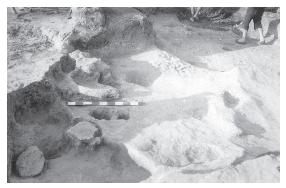
Fig. 3. Building Complex no. 13 in the excavation area "Osnovnoj".

most notable items found within the limits of the dug-out and which may in some way have been connected with its main function are, however, the 272 hardened splashes and ingots of copper with a total weight of 2.5 kg, and 187 pieces of various parts of ovens including one severely scorched tubular nozzle.