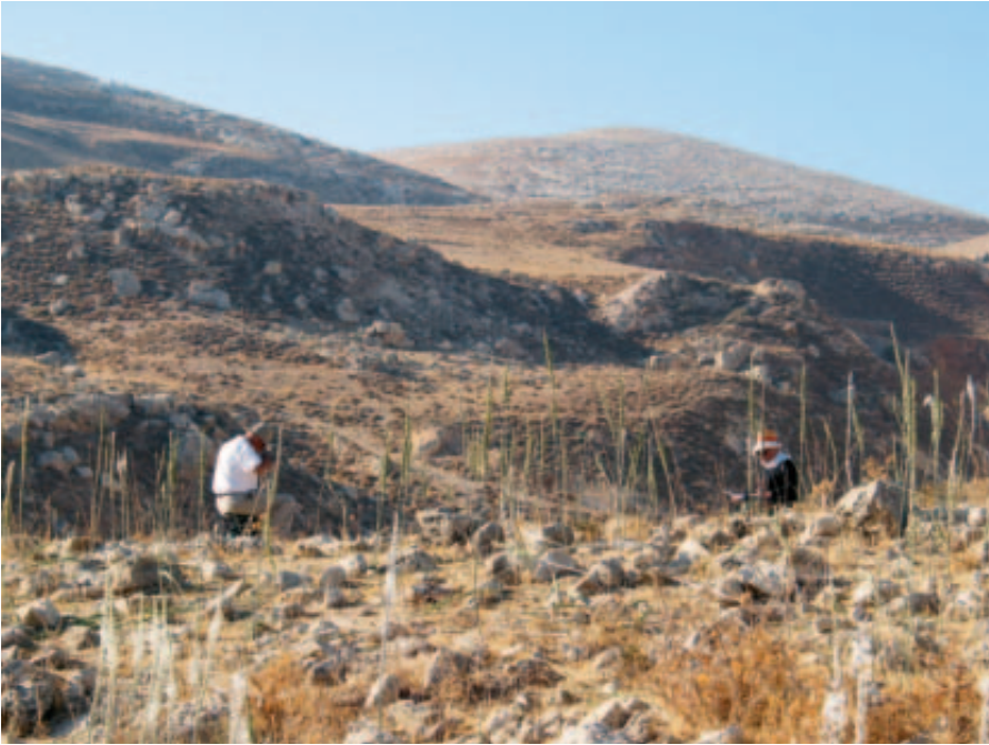
Fig. 12. In the field again – Mount Nebo.

valley far beyond anything our half-hearted efforts in 1962 – 64 had ever led us to suspect (Mortensen 1974a – 1979).