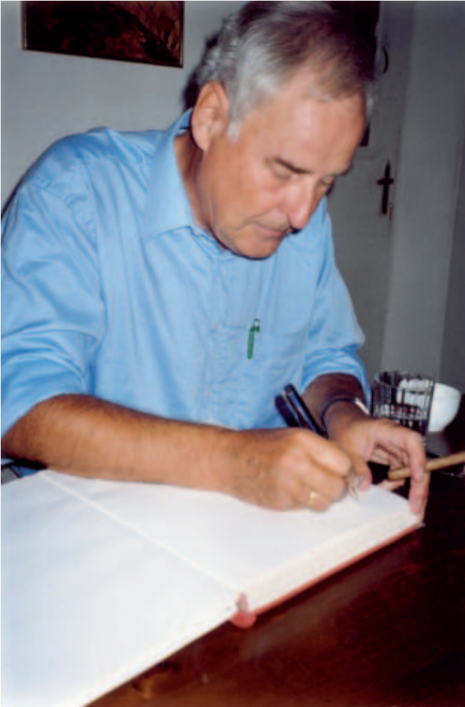
Fig. 13. With the indispensable attributes, at Mount Nebo monastery, 2003.