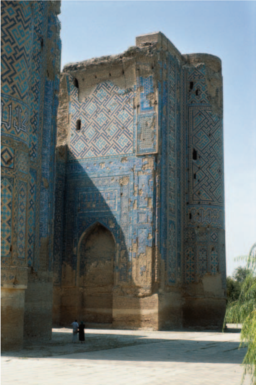
Fig. 10. Dwarfed by classic Islamic architecture – Inge and Peder in Shakhrisabz, Uzbekistan. Photographer: the author, Oct. 3 rd 1990.