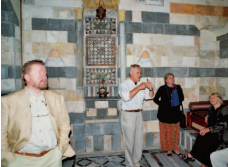
Fig. 14. The enthusiastic director explaining the restored Danish Institute in Damascus to i.a. the artist, Bjørn Nørgaard (left).