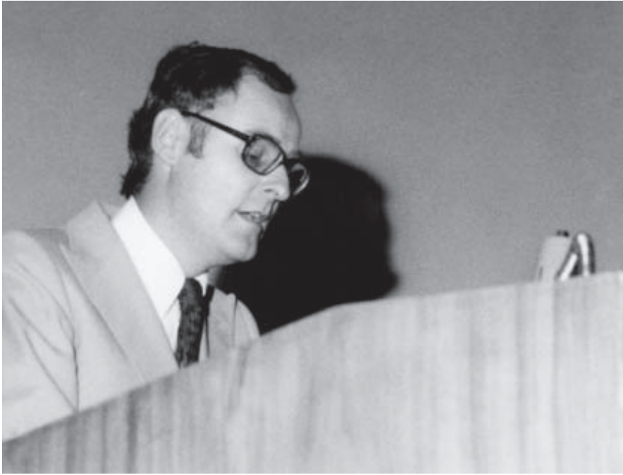
Fig. 8. Lecturing at Teheran University, 1977.