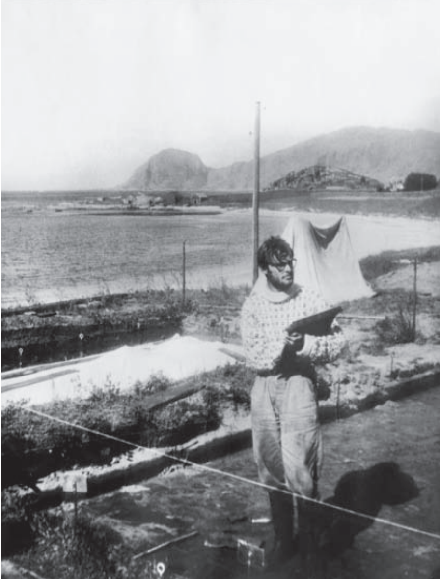
Fig. 1. First dig abroad, at Kvamsøy, Norway 1954.

This was indeed a somewhat ‘special version’ of how archaeology professors tended to receive their new (and few) students who had turned up at the beginning of term in early September with great expectations only to be told that September was for digging and that teaching would first begin in October.