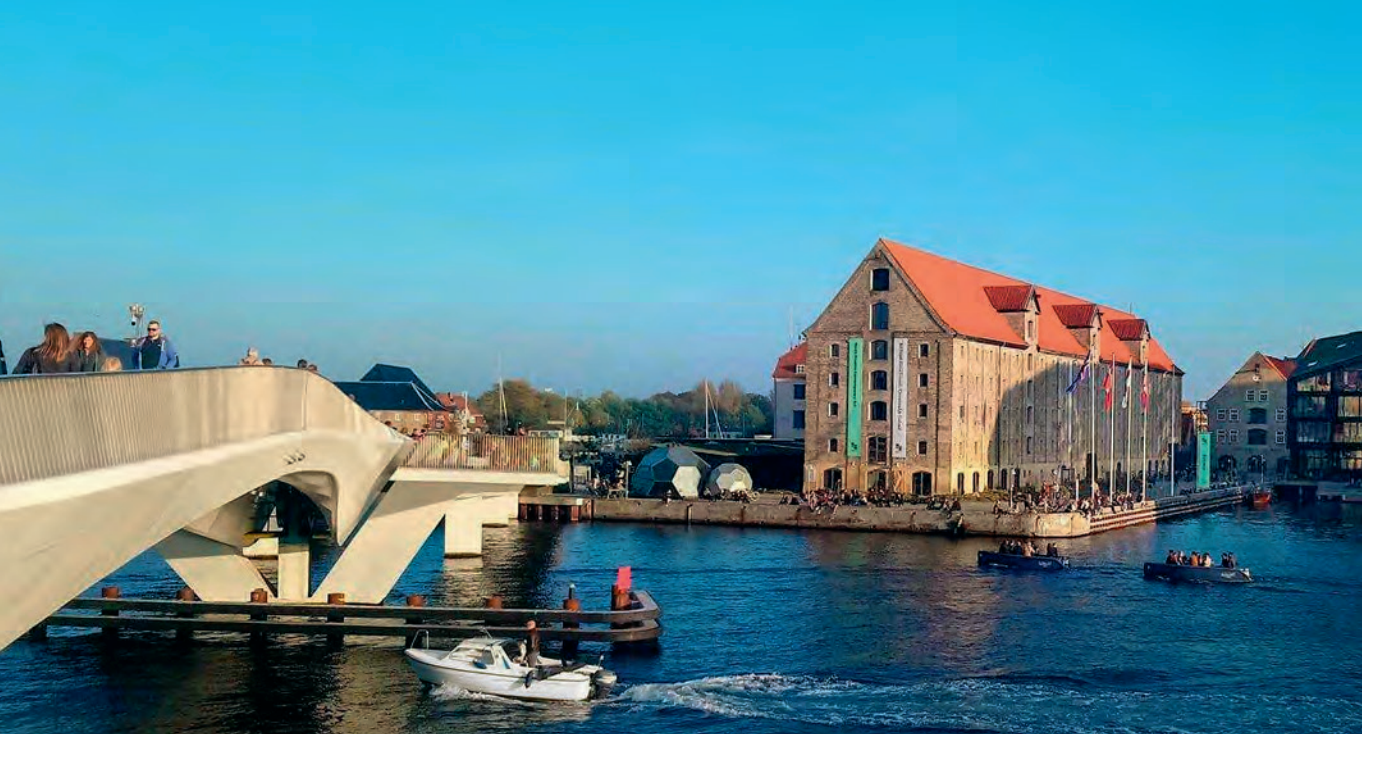
Nordatlantens Brygge in Copenhagen, a center for Greenlandic, Icelandic and Faroese culture and the seat of the Icelandic Embassy and the Greenlandic and Faroese representations. It was inaugurated in 2003.

In Sweden and Finland, not even the helpful extension of 'Scandinavian North Atlantic' or 'Nordic North Atlantic' seems to have the specific significance discussed here.