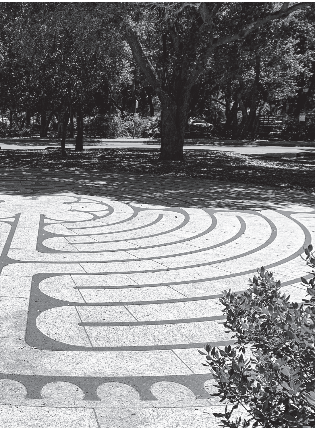
A pilgrimage labyrinth on the Stanford University campus.