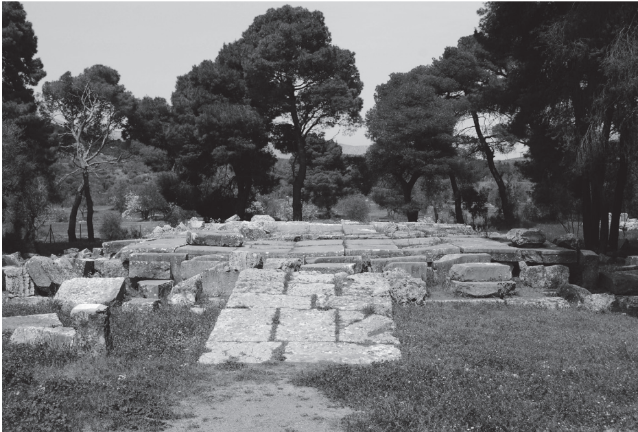
The propylon of the Asklepieion of Epidauros, seen from the south.