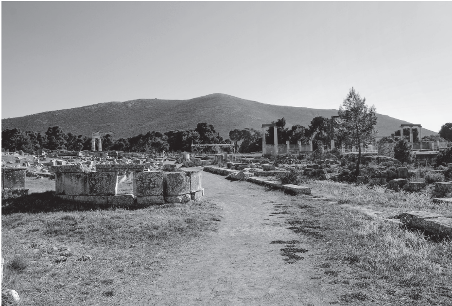
A sociopetal space where access to the “Festplatz” of Epidauros was restricted by the construction of an exedra, seen to the left.