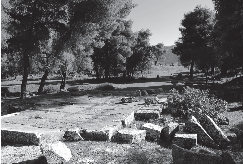
Fig. 5. Looking from the Asklepieion propylon towards the open area to the south, showing the ascent to the main area of the sanctuary.

the lenses of both “place” (as a monument that pilgrims formally had to pass through and whose materiality they were required to negotiate) and “motion” (as a monument that led pilgrims from one crucial part of the experience of going to “see” Asklepios to another, and in creating a particular moment in the spatial story of their journey from Epidauros town to the sanctuary).