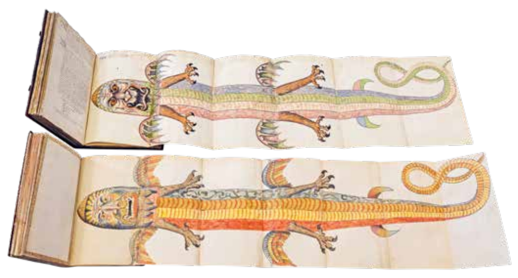
Fig. pp. 332f [99] and the corresponding illustration in Thott 273 (above).

dedication of NKS 101 and its richer layout with ornamented borders (Fig. p. 6). Two illustrations present in Thott 273, but absent in NKS 101, have been included in the publication (Fig. pp. 366f and 424f). See further elaborations on the comparison of the two manuscripts by Lasse J. Bendtsen.